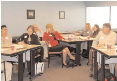
Participants listen to ideas from their peers for assessing student work.