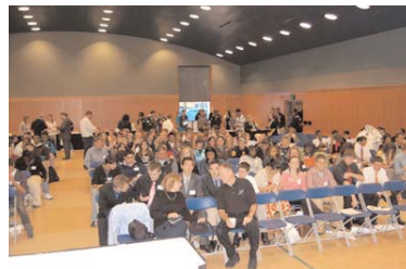
Attendees arriving at the opening session in Quinnipiac's Alumni Hall.