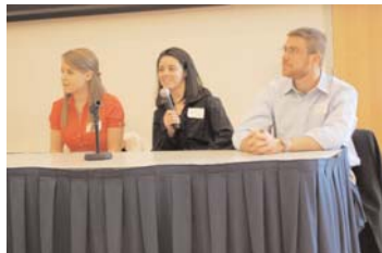
A panel of young accounting professionals share their experiences with students.