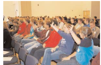
Students attending the conference at UCONN asked many questions about the CPA profession.

More pictures can be found at: www.cscpa.org/photos