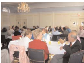
Participants discuss a shareholder case study during the Session I ethics presentation.

The Connecticut Accounting Forum for Educators, known as C.A.F.E., was held on Friday, November 2nd at Saint Joseph College in West Hartford. This year's program titled, CSI: Accounting , focused on business ethics, fraud, and the continually growing niche practice of forensic accounting.