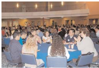
Students take their seats at the Student Center at CCSU (above) while the Accounting Crows offer up some tunes and stories to get the morning started (right).

New Milford High School Nonnewaug High School Norwalk High School RHAM High School Sheehan High School Shelton High School Somers High School Terryville High School Trumbull High School Vinal Tech High School Wamogo Regional High School Westbrook High School Wethersfield High School Woodstock Academy