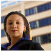
Commercial Property & Casualty