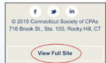
Mobile version (bottom of screen)