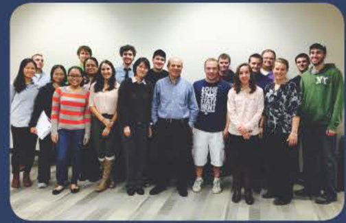
Eastern Connecticut State University Accounting Society

Visit www.ctcpas.org/collegemonth to sign up or contact Alicia Strong at alicias@ctcpas.org or 860-258-0217 to learn more.