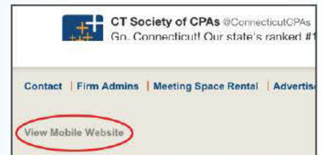
Desktop version (bottom left of screen)

Whether you're on your desktop or mobile device, you can always flip back and forth between versions using these prompts at the bottom of your screen.