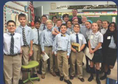
University of Connecticut Beta Alpha Psi with Junior Achievement students