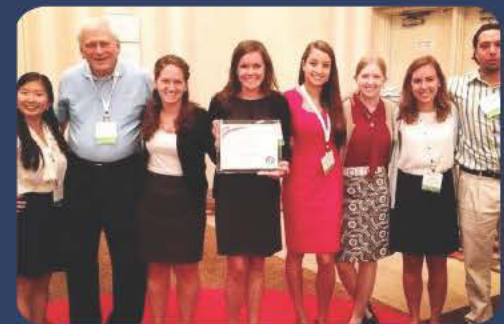
University of Connecticut Beta Alpha Psi