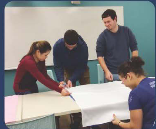
Post University Accounting Society makes baby blankets to donate.